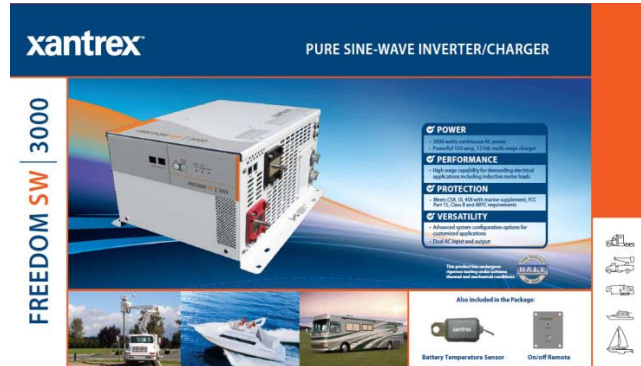
RETAIL BOX PICTURE