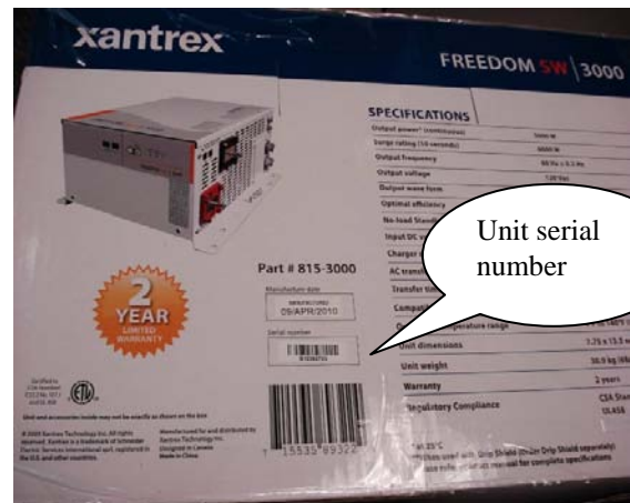
ON THE RETAIL BOX